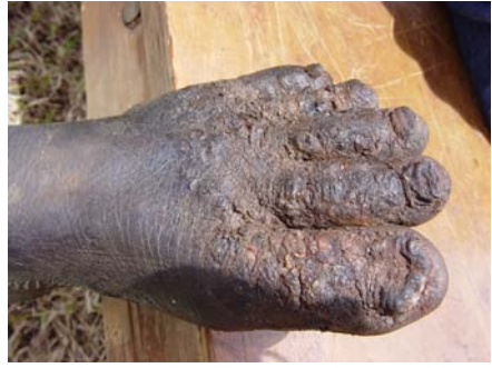
Left top a child with a high fever; Right top a child's foot with chigger wounds. Lower left a n adults foot with severe chigger wounds