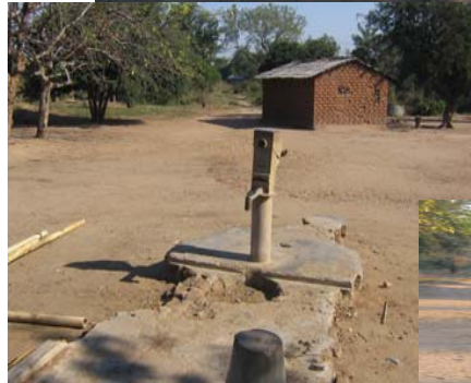
Clockwise, from top: parts needed to fix borehole; a map of Malawi; Children using fixed borehole; Broken borehole.